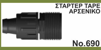
TAPE MALE ADAPTOR