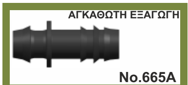
BARBED TAKE OFF W/O RUBBER