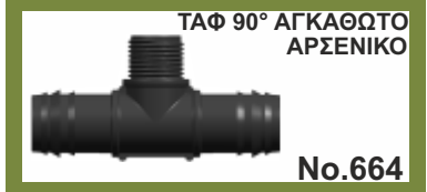
BARBED MALE TEE