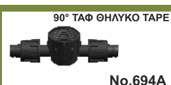
TAPE FEMALE TEE