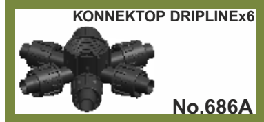
DRIPLINE SIX CONNECTOR FEMALE