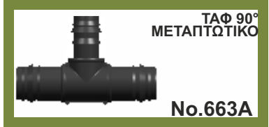
BARBED REDUCING TEE