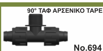
TAPE MALE TEE