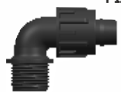
ΓΩΝΙΑ ΑΡΣΕΝΙΚΗ DRIPLINE