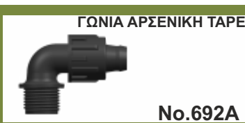
TAPE MALE ELBOW