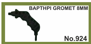
PUNCH & PUSHER TOOL 8MM