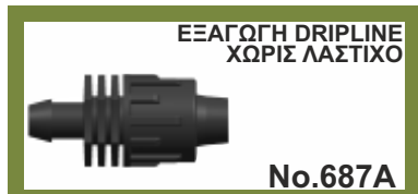
DRIPLINE GROMET W/OUT RUBBER