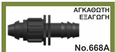
BARBED OFFTAKE WITH RUBBER