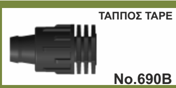
TAPE END PLUG