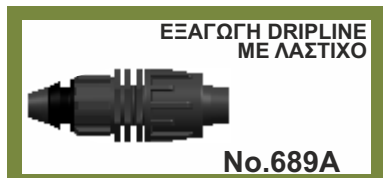
DRIPLINE OFFTAKE WITH RUBBER