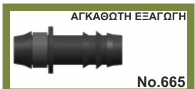
BARBED TAKE OFF WITH RUBBER