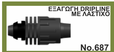
DRIPLINE GROMET WITH RUBBER