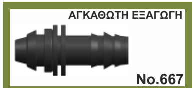
BARBED GROMET WITH RUBBER