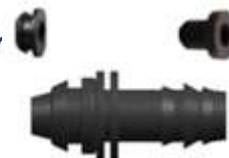
Barbed No. Gromet with Rubber 667