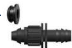
Barbed No. Offtake with Rubber 668A