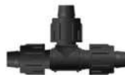
No. 683 for Driplines Tee