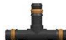
No. 643 Safety Tee