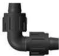
No. 682 for Driplines Elbow