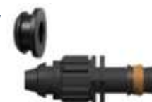
No. 649A Safety Offtake with Rubber