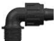
No. 682A for Driplines Elbow Male