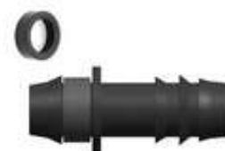
Barbed No. Take Off with Rubber 665