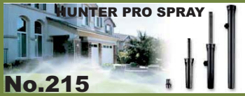
HUNTER PRO SPRAY