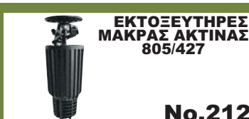
LONG RADIUS POP-UP