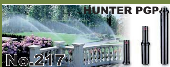
HUNTER POP UP