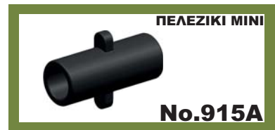
MINI COLLAR SOCKET